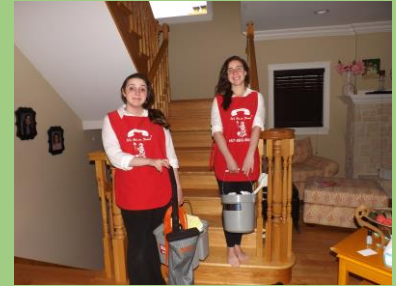
A special thanks to all these fine folks who referred us. We greatly appreciate it!